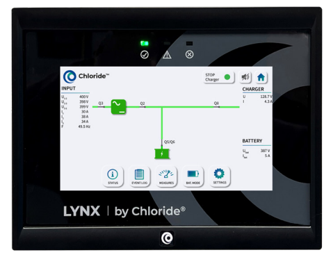
LYNX by Chloride® - Human-machine Interface (HMI)

As an option, the front panel of the system includes a large, colour touchscreen LYNX with intuitive graphical interface that simplifies system setup, operation, and troubleshooting.