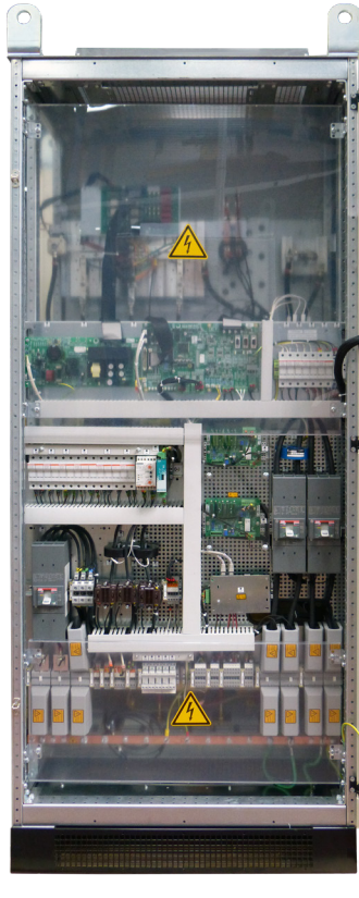
Example of Chloride® CP70R-110V-50A-6P