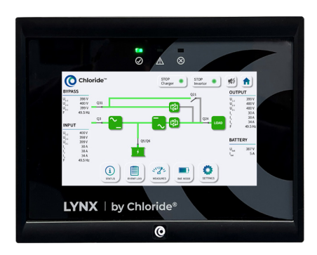
Lynx by Chloride® - Human-machine interface (HMI)

The front panel of the system includes a large, colour touchscreen LYNX with intuitive graphical interface that simplifies system setup, operation, and troubleshooting.