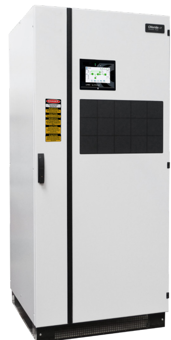
Example of Chloride® CP70R-48V-200A-6P