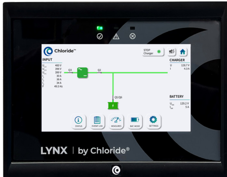
LYNX by Chloride® - Human-machine Interface (HMI)

As an option, the front panel of the system includes a large, colour touchscreen LYNX with intuitive graphical interface that simplifies system setup, operation, and troubleshooting.