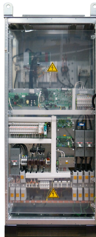
Example of Chloride® CP70R-127V-150A-6P

The above illustrations show some examples of finished systems. As each system is customized to specification, the internal layout might be different for different units.